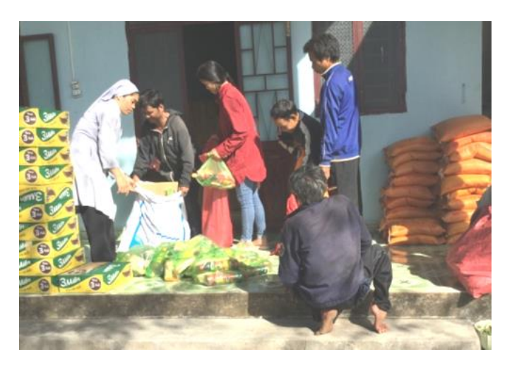
Caring for our little ones and for our elders is a choice for civilization. And also for the future, because

the little ones, the children, the young people will carry society forward by their strength, their youth, and the elderly people will carry it forward by their wisdom, their memory, which they must give to us all.